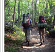
Applebome: Trail and Its Fans Age Together