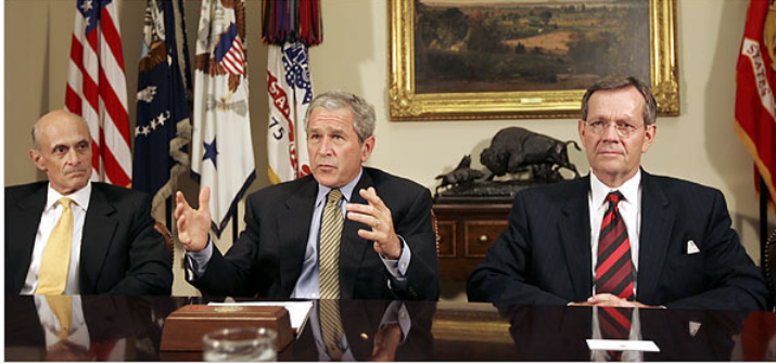
President Bush with Michael Chertoff, secretary of homeland security, left, and Michael O. Leavitt, secretary of health and human services.