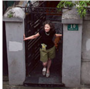
A Former New Yorker in Shanghai