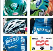
For Sponsors, Tour Is a Bonanza of Exposure