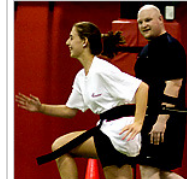
Train Like a Pro, Even if You're 12